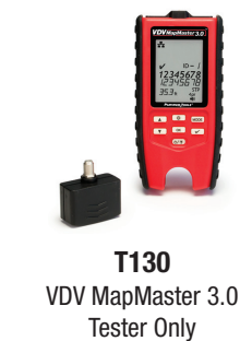
T130 VDV MapMaster 3.0 Tester Only