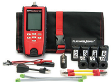
T130K2 VDV MapMaster 3.0 PRO Kit