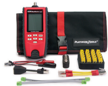
T130K1 VDV MapMaster 3.0 Cable Tester Kit