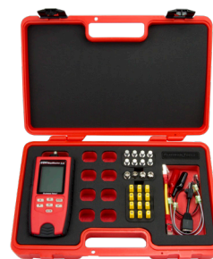
T130K4 Network & Coax Field Kit