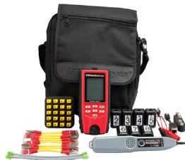
T130K3 VDV MapMaster 3.0 Deluxe PRO Kit