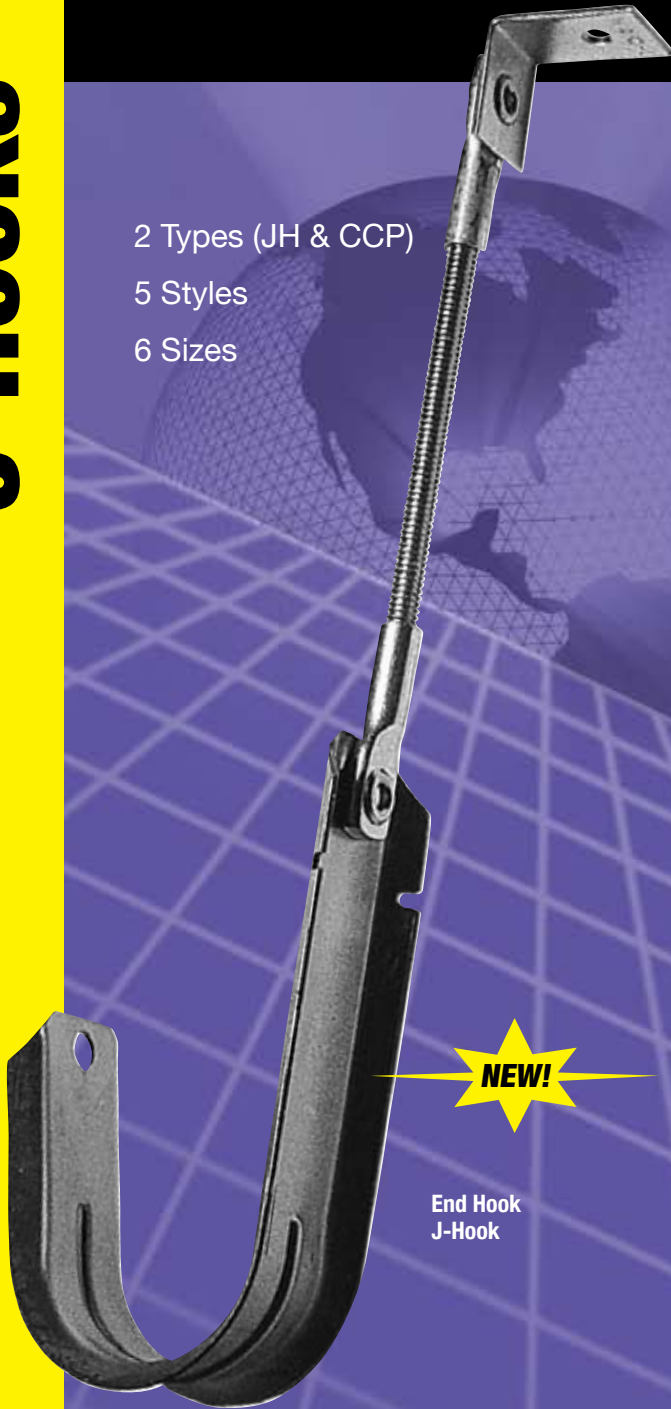
End Hook J-Hook