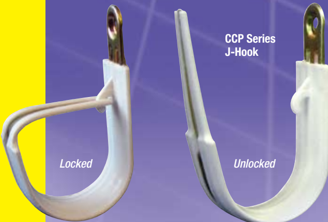
CCP Series J-Hook